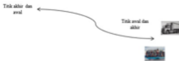
Fig. 2. Operational process of the Allocation Cheap Sourcing system

The working pattern of the Allocation Cheap Sourcing system is a shuttle. Vehicles, fleets or means of transportation from the starting point carry goods/people to the destination and return by carrying goods/people without having to wait, the difference with what is already running today is that the vehicle, fleet or means of transportation at the time of return is never empty because the goods or people have been prepared in advance by the partnership or NFO. The operational process of the Allocation Cheap Sourcing system in figure 2