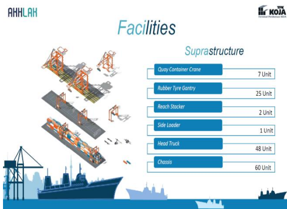
Fig 1. Suprastructure Facilities

Field utilization has not been maximized so that the maximum capacity of the maximum field has not been reached, which means that there are facilities that are idle for quite a long time. Loading and unloading productivity at the Koja Container Terminal is not yet optimal. Based on the background description in the issue request as follows: