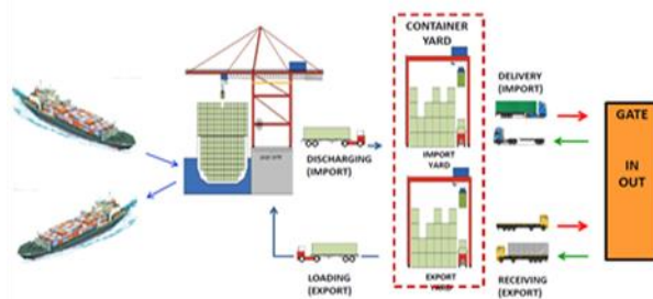
Fig 2. Infrastructure Facilities

Field utilization has not been maximized so that the maximum capacity of the maximum field has not been reached, which means that there are facilities that are idle for quite a long time. Loading and unloading productivity at the Koja Container Terminal is not yet optimal. Based on the background description in the issue request as follows: