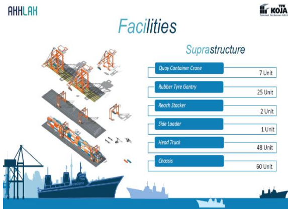
Fig 1. Suprastructure Facilities

Field utilization has not been maximized so that the maximum capacity of the maximum field has not been reached, which means that there are facilities that are idle for quite a long time. Loading and unloading productivity at the Koja Container Terminal is not yet optimal. Based on the background description in the issue request as follows: